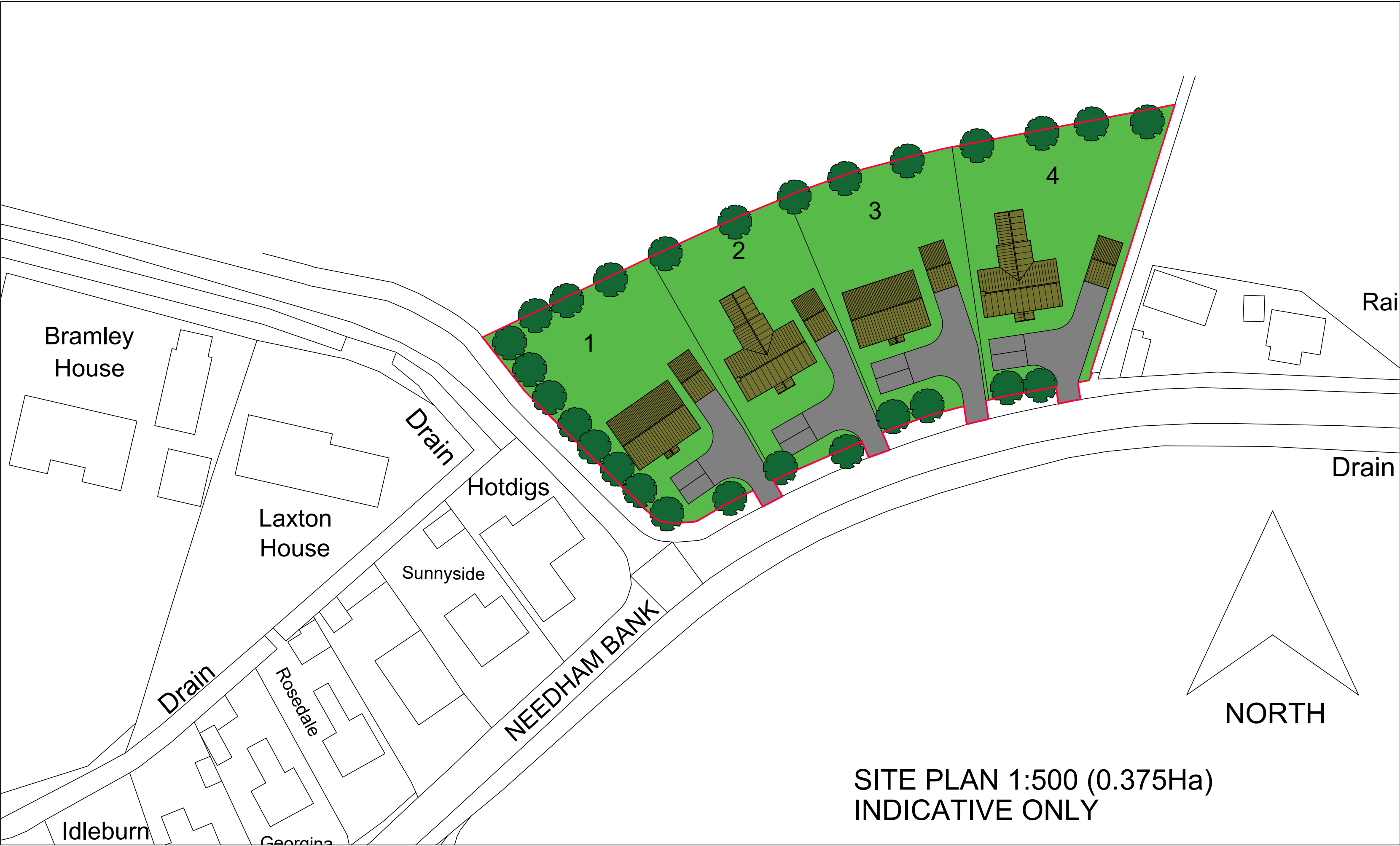
SITE PLAN 1:500 (0.375Ha) INDICATIVE ONLY